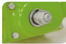
採用密閉裝置防塵防雨 Seal packing design for water-and-dusty-proof