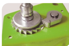
加厚強力煞車棘爪，保障產品安全性 Thickened high strength brake jaw to ensure the safety