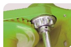
高密度噴塗防止生鏽腐蝕 The surface is finished by high density powder coated for corrosion protection